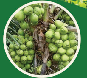
Hybrid Coconut (JK365)