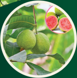
Taiwan Pink Guava